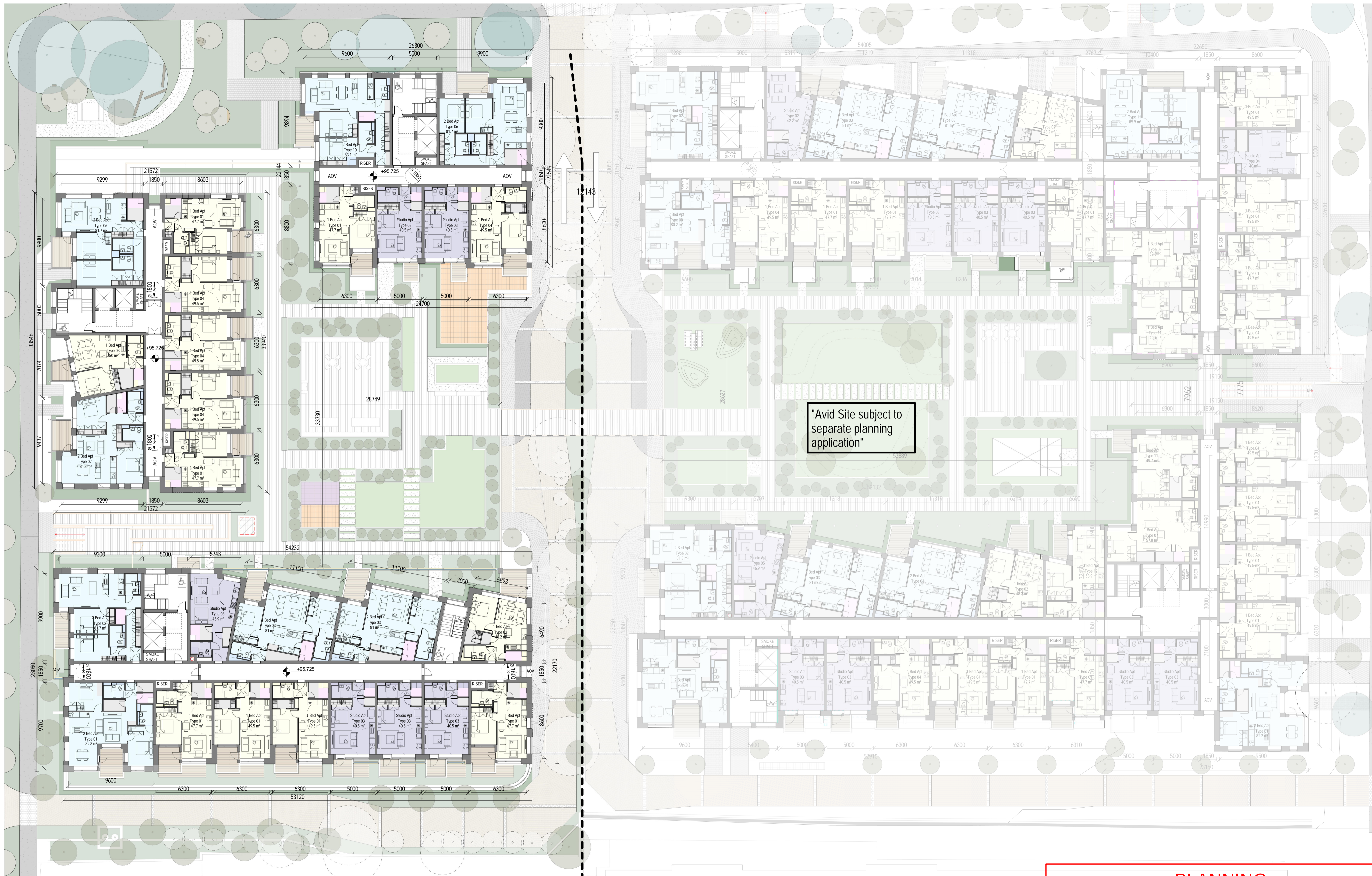
1 02 FLOOR - TACK SITE 90072 1 : 200